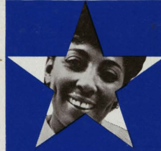
AND CARMEN McRAE