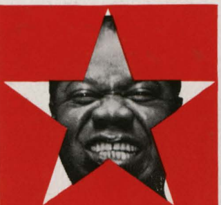
LOUIS ARMSTRONG AND HIS BAND

An Original Musical Production by Dave and Iola Brubeck